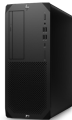
HP Z2 TOWER G9

Windows 11 Pro 9 Intel® Core™ vPro or K-Series 10 NVIDIA® RTX™ A4000 128 GB DDR5 Memory 512 GB PCIe® SSD M.2 11