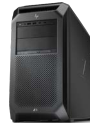
HP Z8 G4

Windows 10 Pro 64 9 Intel® Xeon® 10 NVIDIA® Quadro RTX™ 8000 64 GB DDR4 Memory HP Z Turbo Drive M.2 2 TB 11