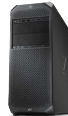
HP Z6 G4

Windows 10 Pro 64 9 Intel® Core™ i9 10 NVIDIA® Quadro RTX™ 8000 32 GB DDR4 Memory HP Z Turbo Drive M.2 2 TB 11