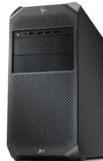
HP Z4 G4

Windows 11 Pro 9 Intel® Core™ vPro or K-Series 10 NVIDIA® RTX™ A5000 128 GB DDR5 Memory HP Z Turbo Drive M.2 512 GB 11