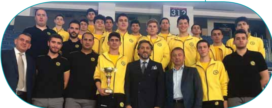
Istanbul Chamber of Commerce Sports Club

Cemile Sultan Grove has an extensive experience in hosting events and corporate services to the business world. Seminars, conferences, weddings, engagement parties, parties and meetings are being held at the venue.