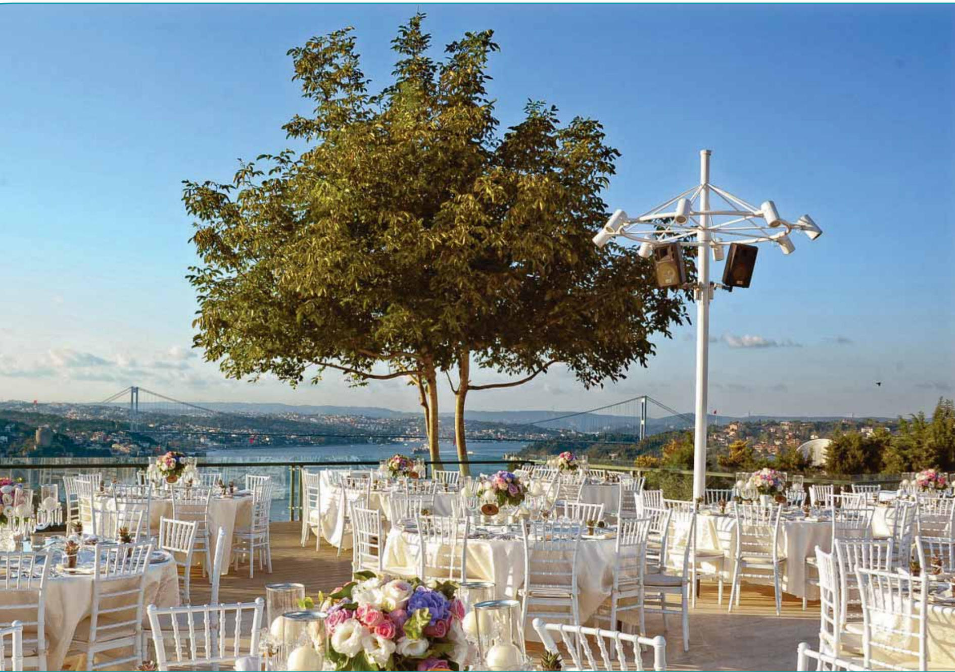
Cemile Sultan Facilities