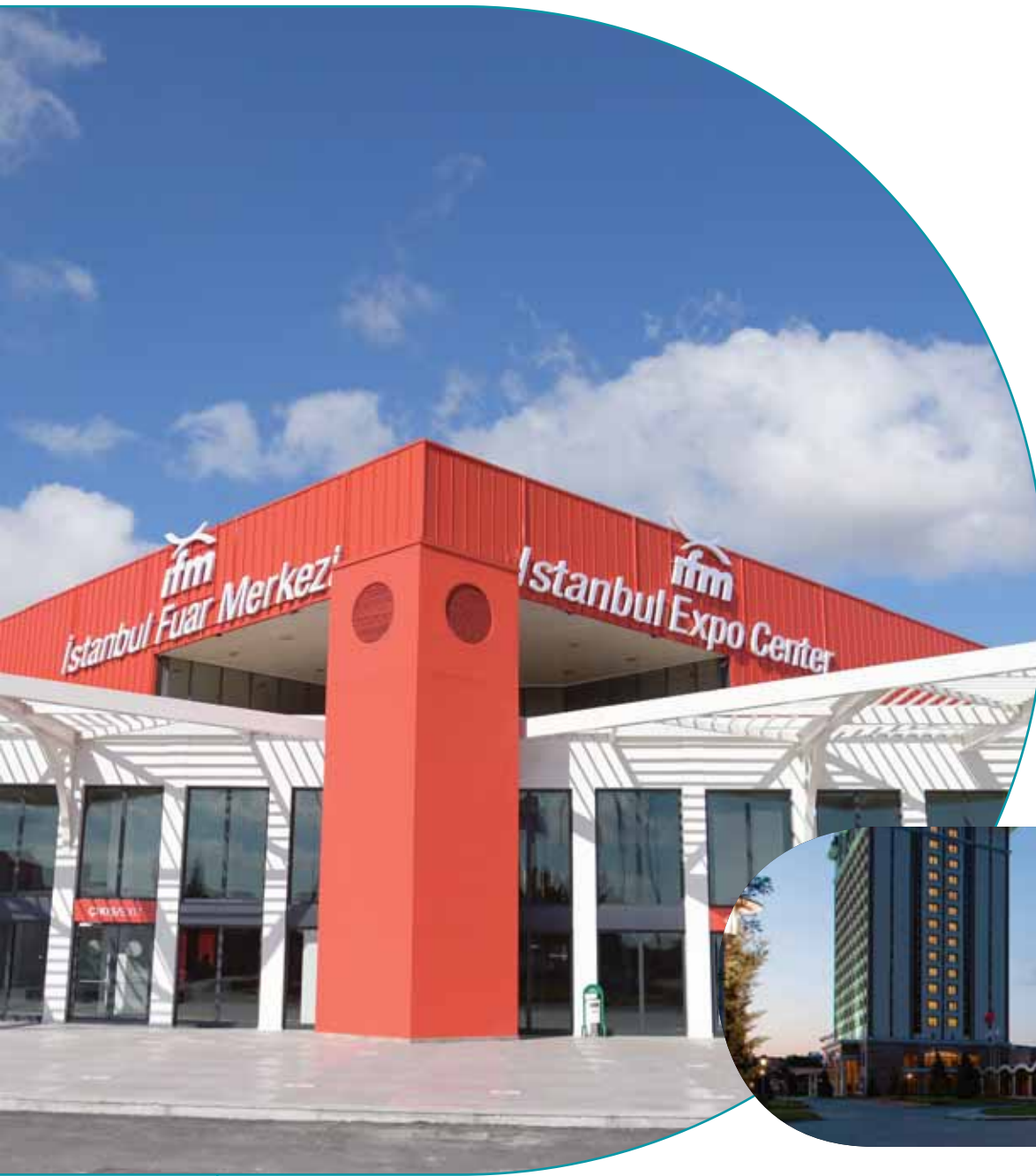
World Trade Center Istanbul