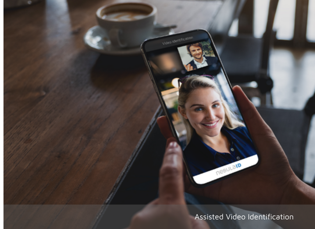
Assisted Video Identification

Remote video identification offers two types of processes: online video identification in real-time, assisted by an operator from the Registration Authority , or unassisted identification, without the need for interaction between the operator and the requesting user, with subsequent review of documents and biometric tests by the operator. Both processes have total probative value.