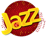
A subsidiary of Veon Group

From the beginning, M.M. focus has been developing solutions for telecom operators. Since its inception, M.M. has been successfully delivering projects in the thematic area of digital transformation. Over the years, M.M. has moved into other industries and is now serving 20 different global markets and has offices in four countries. Based on all of these experiences and successful deliveries, M.M. has created its own digital transformation model called Digital Enablement.