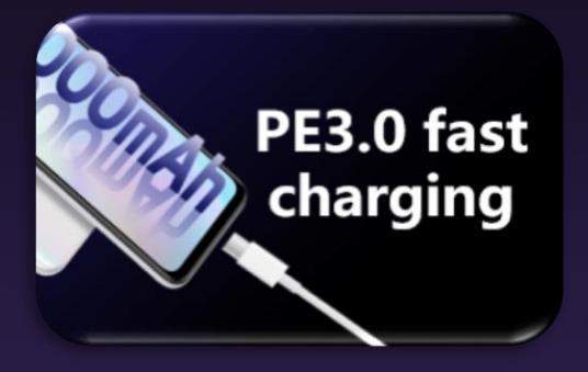
PE3.0 Fast Charging Technology