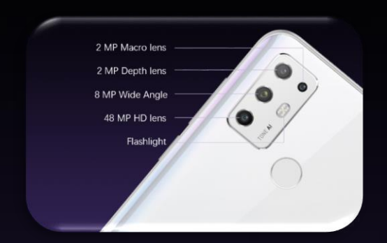
48 MP HD Penta Camera