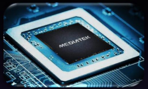
MT6765 Octa-core Processor