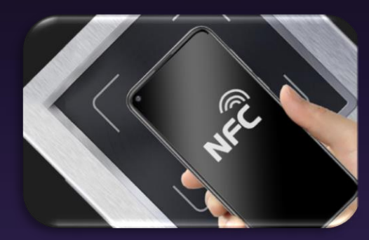
Multi-function NFC Fast Connect