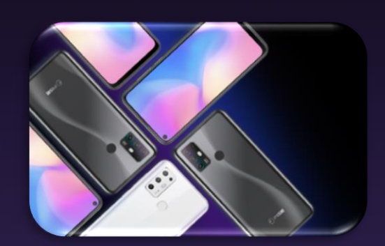
Colorful Ultra-thin Body 8.6mm Thickness