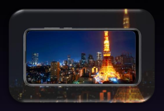
6.53" FHD Perforated Screen