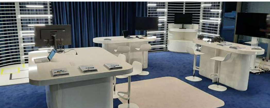
Our facilities in Paris

3 - Standardize the usage of 5G technologies to encourage sustainable innovation for industries. Continuous development of enriched assets, use cases, and credentials with best-of-breed solutions that exceeds market expectations.