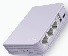
Brume / GL-MV1000

For small offices with high VPN performance