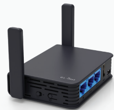
Slate / GL-AR750S