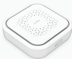
Convexa-B / GL-B1300

Simple routers connect your multiple offices to one LAN network.