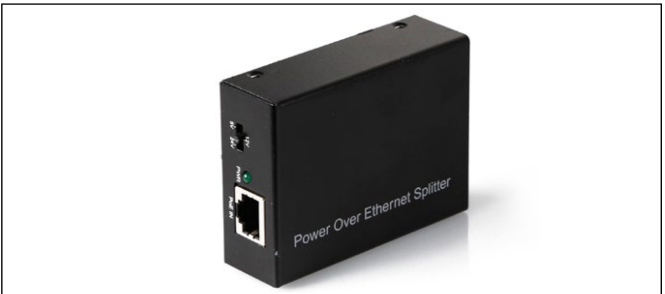
Figure 4 – typical industrial / light-industrial POE splitter

Some POE splitters provide a flexible DC output voltage. The example below shows a 12 VDC or 24 VDC selectable model as supplied by Robustel.