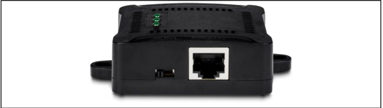
Figure 3 - A typical POE Splitter – 'POE IN' terminates the powered run of CAT5 / CAT6 cable. 'DATA OUT' connects to external device. 'DC OUT' provides power to attached device.

A splitter is able to "split" the Data and Power connections back into their component parts and is able to provide a solution for remote powering of non-PoE devices.