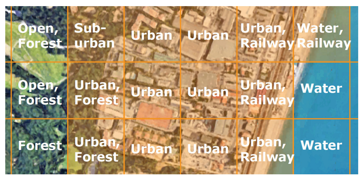
Automated classification of squares into area classes helps to "mine" for relevant information