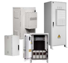
Vertiv™ Outdoor Enclosures

Space saving NetSure™ Inverter Systems maximize efficiency at 5G and Edge sites.