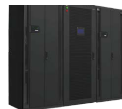
NetSure™ 400V DC Power System