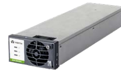
R48-3500E4 eSure™ Rectifier