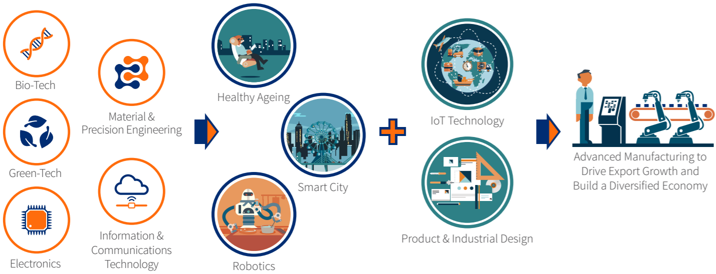
Driving for re-industrialisation to propel economic diversification

We help innovators connect with research partners to accelerate their development, and collaborate with business partners to catalyse the commercialization of innovative products and solutions across 5 technology clusters and 3 application platforms of Smart City, Healthy Ageing and Robotics. In addition to investing in 6 state of the art shared labs for our ecosystem to use, Science Park also provides the perfect “living lab” environment where technologies are tested out, and demonstrated to potential customers through the “Technologies from Science Park” programme that facilitate large enterprises to adopt home grown innovations. Our team will also be bringing our tech companies on roadshows to different cities within Mainland China, as well as participating in international tradeshows and competitions to expand business opportunities.