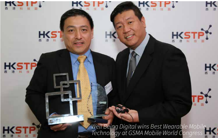
Attain international recognition