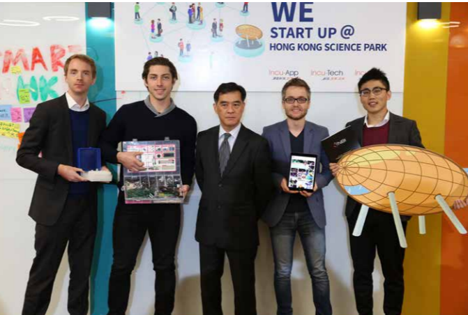
Nurture talents and future CEOs

To prepare our young talents for a future that is shaped by technology, we encourage them to embrace STEM education through robotic and science workshops for cross-disciplinary technology applications, inspire them through internship and entrepreneurs sharing, as well as hackathons that challenge their creative minds and let them gain a taste of being a technopreneur. Our award winning Incubation Programmes helped over 700 young technopreneurs realize their dreams, and we are seeing increasing investment interests in their inventions. Just for the past year of 2015-16, our incubatees were able to attract over HK$320 million investments.