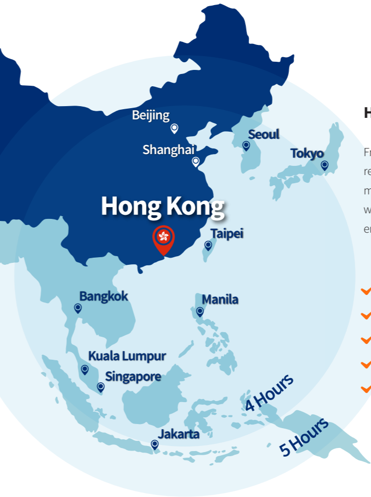
Strategically positioned to help you succeed