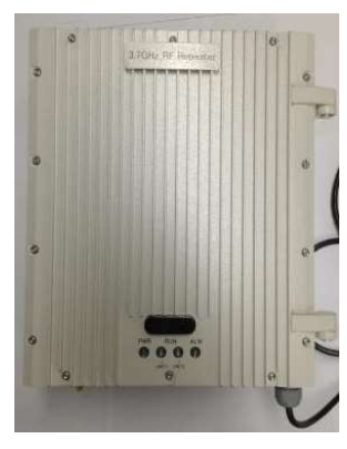
External view of prototype